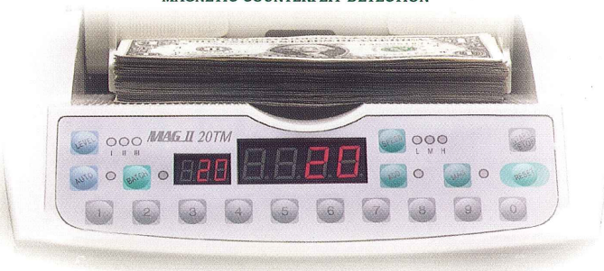
MODEL 20TM WITH MAGNETIC COUNTERFEIT DETECTION

Nationwide service is available through our authorized dealer network.